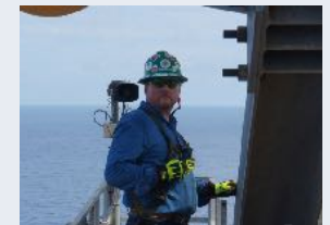
DOH Inspection in the Derrick

Using industry standard practices for dropped objects prevention, we provide inspection services, train rig personnel and can assist you in creating a custom solution for your specific needs. IRIIS developed a software application for collection and reporting of DROPS inspections. This application was developed in house and provides accurate detailed reports while reducing the time it takes to collect the information and complete the final detailed report and a failure report.