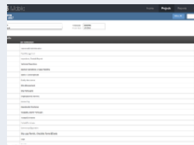
Rig selection report